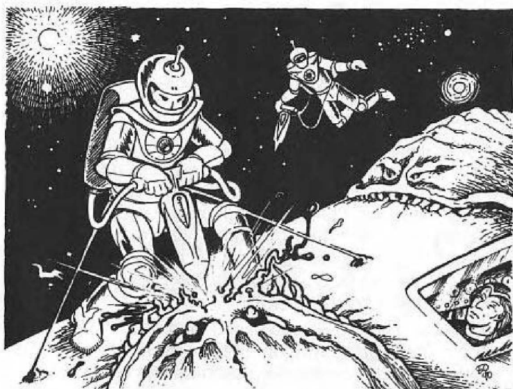
"Removing VUX Limpets After a Battle"

Nonetheless, the Discriminator is fast and agile, a characteristic which led one Earthling crew to nickname the craft the "space jitterbug." Discriminators dodge most enemy weapons.