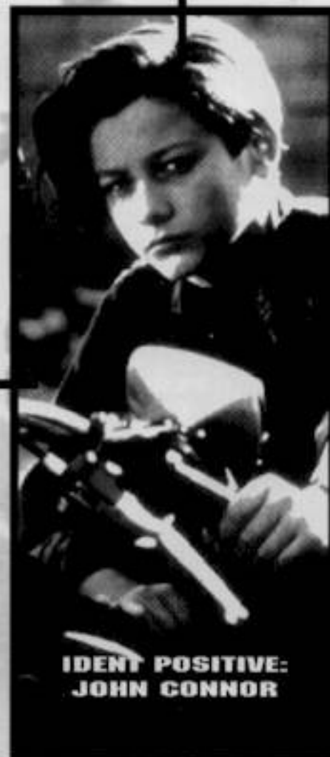
IDENT POSITIVE: JOHN CONNOR

RECOMMENDATIONS... AVOID UNNECESSARY VIOLENCE.