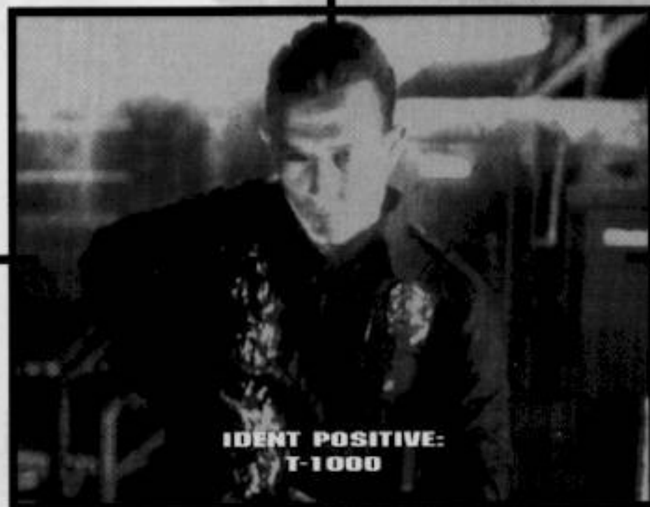
IDENT POSITIVE: T-1000

96.1% PROBABILITY T-1000 WILL TRY TO ACQUIRE JOHN CONNOR AT PRESENT LOCATION. PROBABLE T-1000 OBJECTIVE... TERMINATION OF JOHN CONNOR.