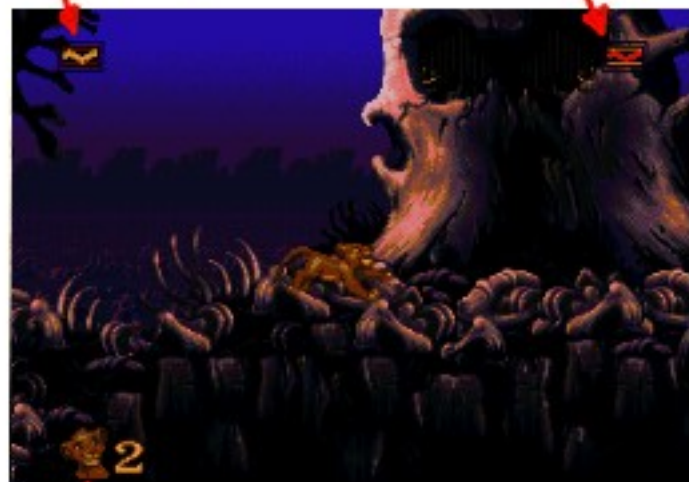
SIMBA CHARACTERS REMAINING

ROAR METER: The might of Simba's roar increases with every Blue Beetle collected. Note that the Roar Meter is emptied when Simba begins a level or is hit by anything unpleasant.