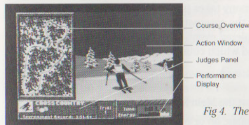
Fig 4. The Playing Screen