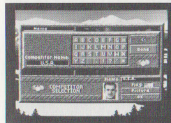
Fig 2. Creating Competitors

The Add option lets you create a competitor with a name, a flag, and a face (see Fig 2).