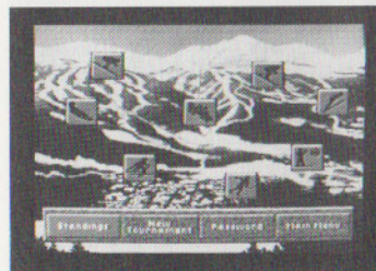
Fig 3. Tournament Screen

Once you've created your roster of competitors, and the Opening Ceremonies are over, the Tournament Screen appears with the following options: Standings , New Tournament , Password , and Main Menu .